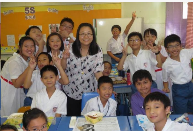
Welcome ceremony cum mini concert