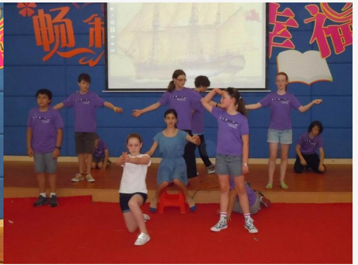
Lessons and activities