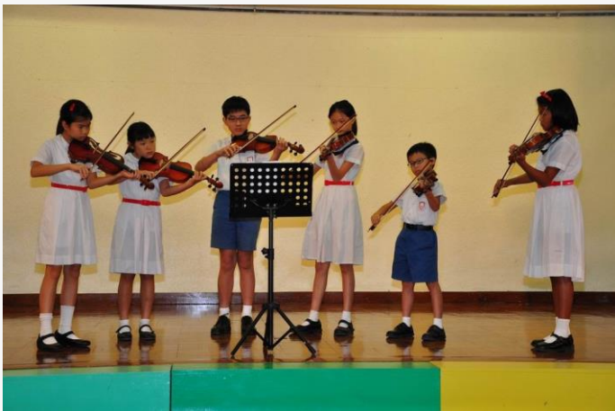
Open Lesson conducted by PHPS teachers