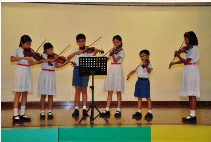
Open Lesson conducted by PHPS teachers