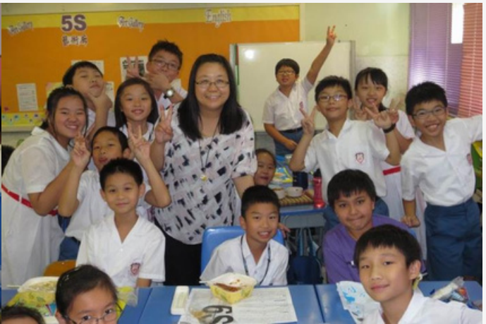
Welcome ceremony cum mini concert