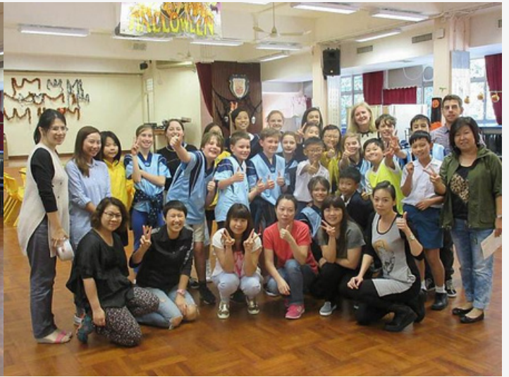
Goodbye, Hong Kong