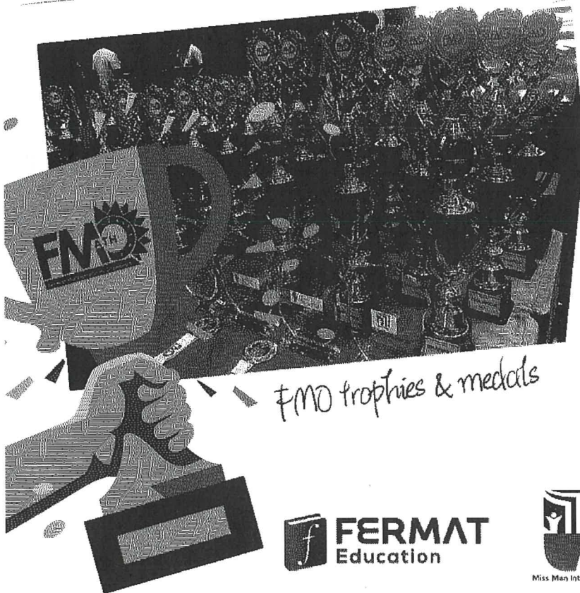
FMO trophies & medals