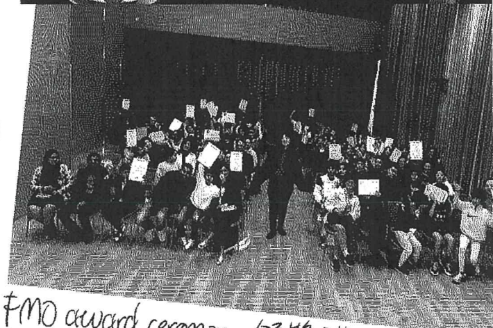
FMO award ceremony 頒獎禮